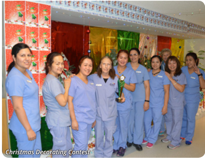
Christmas Decorating Contest