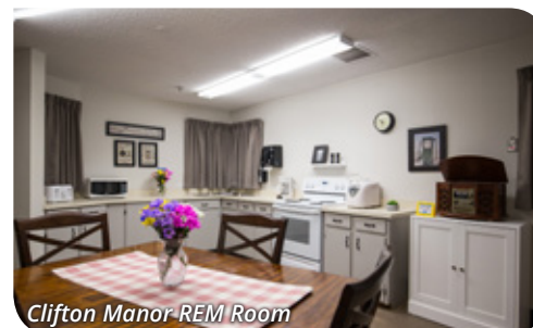
Clifton Manor REM Room