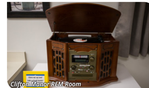
Clifton Manor REM Room

Kin Canada Kinsmen Club of Stampede City