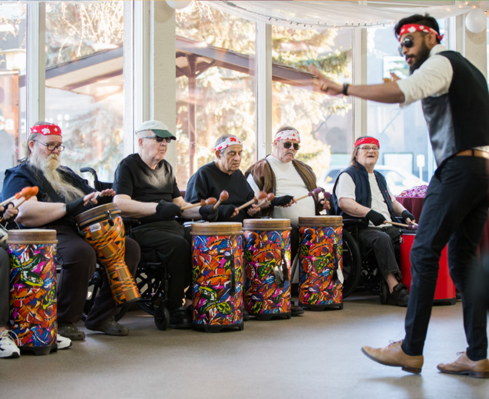
Clifton Manor Drumming Circle