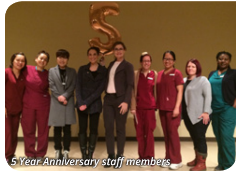
5 Year Anniversary staff members