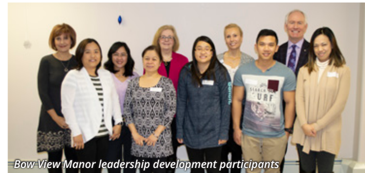
Bow View Manor leadership development participants