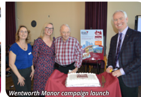
Wentworth Manor campaign launch