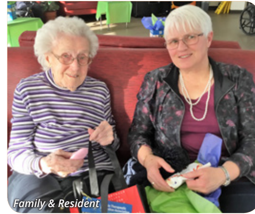
Family & Resident