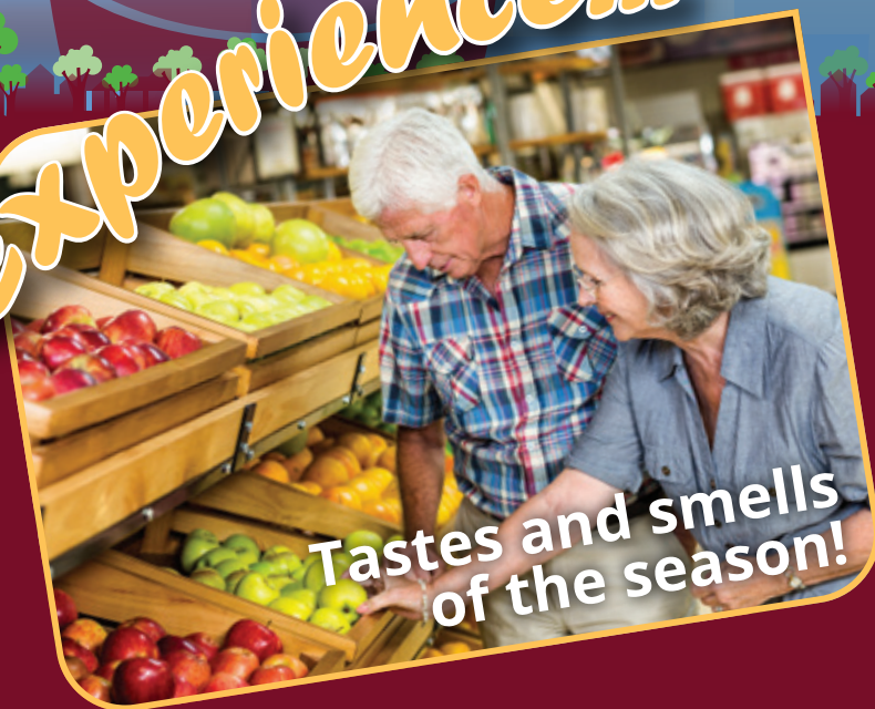
Tastes and smells of the season!