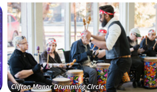
Clifton Manor Drumming Circle