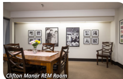
Clifton Manor REM Room