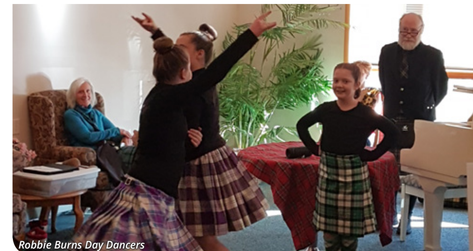
Robbie Burns Day Dancers

If you see me around and wondering about the "cool" design on the side of my head. Well, that's actually a surgical scar from Grade 4. I got struck in the head with a softball and they needed to fix the crater size dent the ball left. The scar actually runs to the top of my head. I'm not shy about my scar and I always welcome questions about it. I will say that I do not beep at airports, that one is the most commonly asked. I look forward to working at Wentworth Manor and getting to know the residents and their family members.