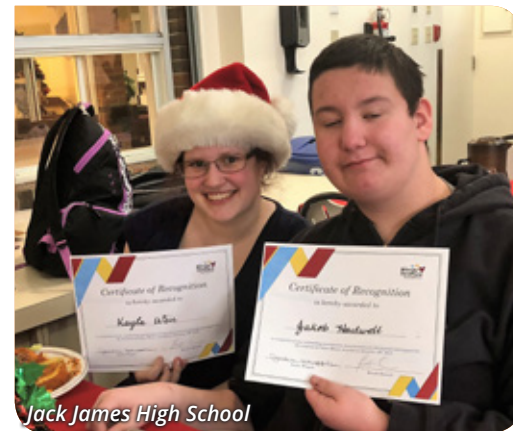
Jack James High School