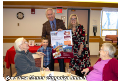
Bow View Manor campaign launch