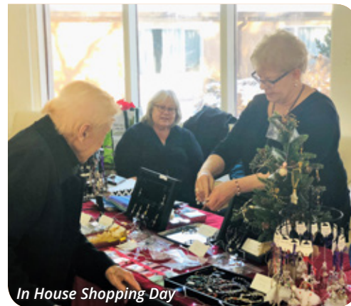
In House Shopping Day