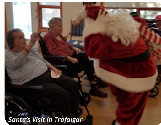
Santa's Visit in Trafalgar