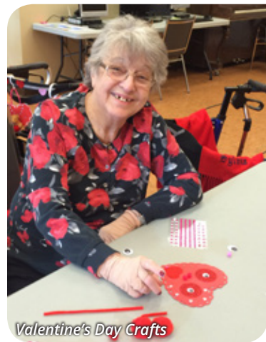
Valentine's Day Crafts