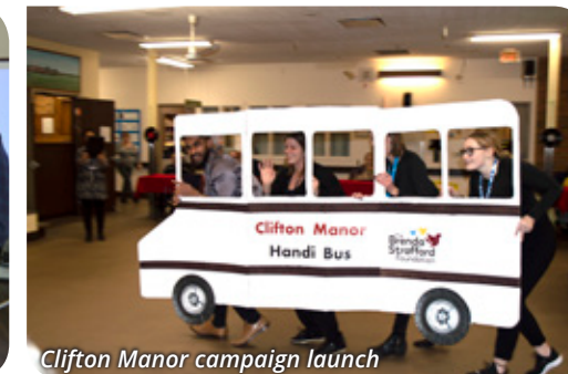
Clifton Manor campaign launch