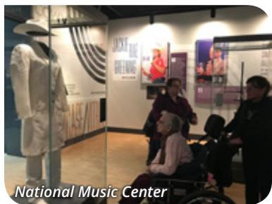
National Music Center