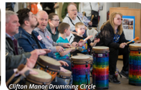
Clifton Manor Drumming Circle