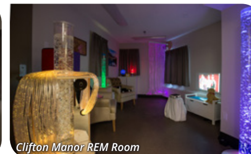
Clifton Manor REM Room