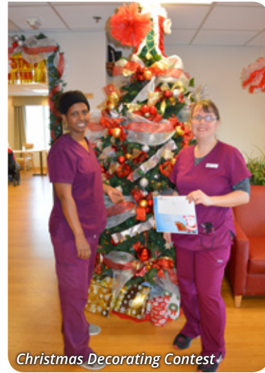
Christmas Decorating Contest