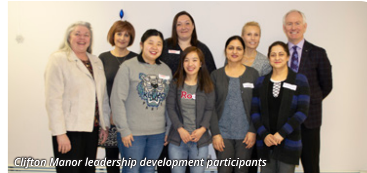
Clifton Manor leadership development participants