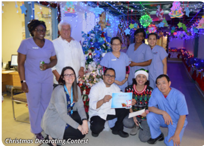
Christmas Decorating Contest