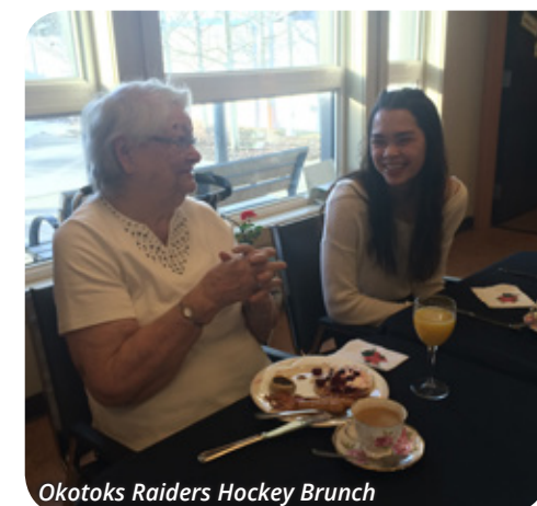
Okotoks Raiders Hockey Brunch