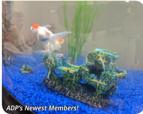
ADP's Newest Members!