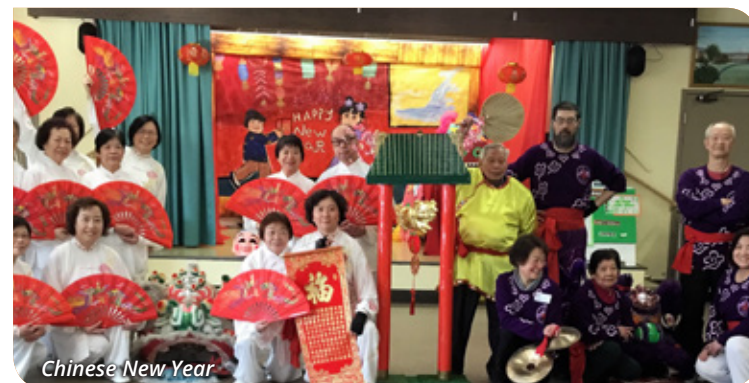
Chinese New Year

The winter season at Clifton Manor has been filled with countless special events, community partnerships, and family-friendly activities. Our holiday season started off with our annual In-House Shopping Day where local vendors were invited into our home to provide an amazing opportunity for residents and their families to enjoy a day of Christmas shopping together.