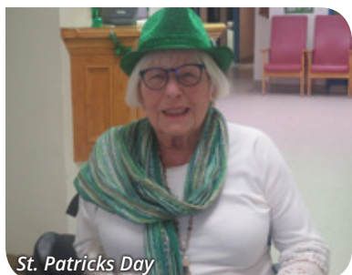
St. Patrick's Day