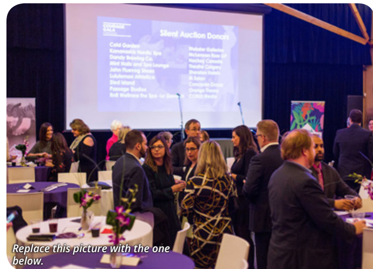
Replace this picture with the one below.