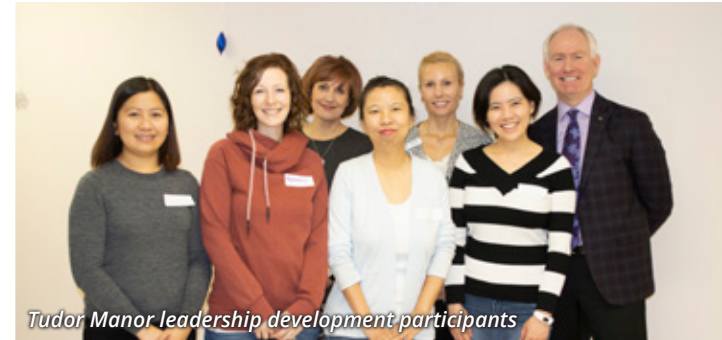
Tudor Manor leadership development participants