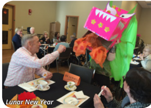
Lunar New Year