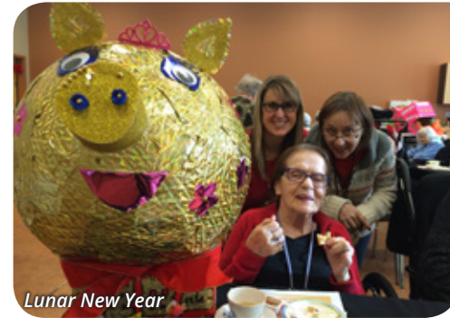
Lunar New Year