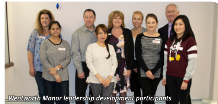
Wentworth Manor leadership development participants

We have continued to leverage a relationship with Conestoga College and created a front line supervisor training course that launched in January 2019. Our intent is to have all front line supervisors go through this program, with the aim of supporting and assisting the organization in moving forward with The BSF Way. We are thrilled to be able to provide this opportunity and also excited about the reaction we have seen from the participants.