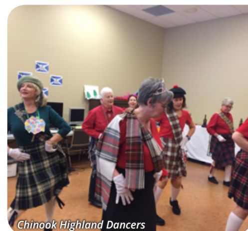
Chinook Highland Dancers