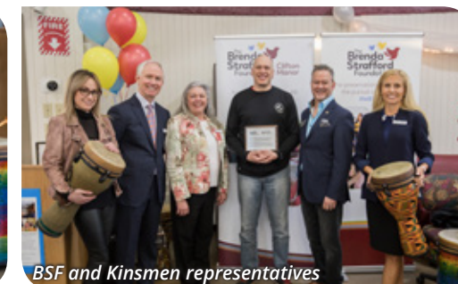
BSF and Kinsmen representatives