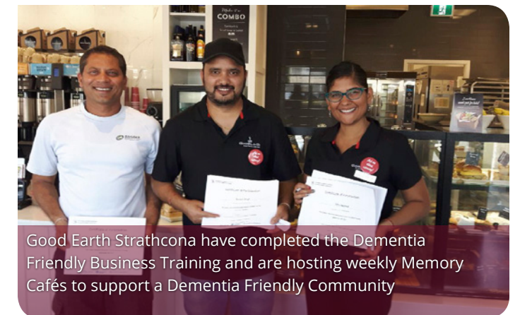
Good Earth Strathcona have completed the Dementia Friendly Business Training and are hosting weekly Memory Cafés to support a Dementia Friendly Community