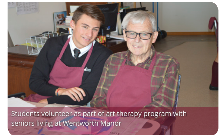
Students volunteer as part of art therapy program with seniors living at Wentworth Manor