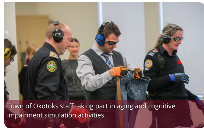
Town of Okotoks staff taking part in aging and cognitive impairment simulation activities

Public awareness/community events – Community outreach events help to engage the local community, increase public awareness of both dementia and the Dementia Friendly Communities project, and provide information about resources and supports.