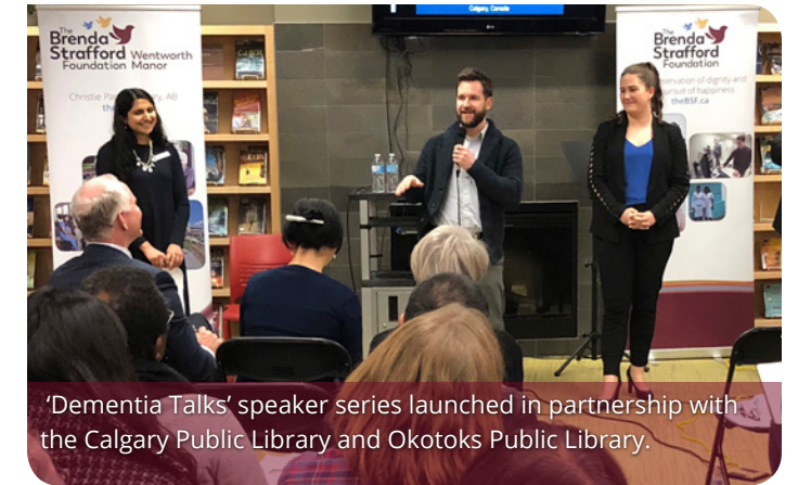
'Dementia Talks' speaker series launched in partnership with the Calgary Public Library and Okotoks Public Library.